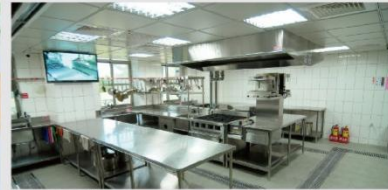
西餐烹調教室 Western Culinary Classroom V101