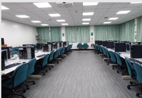
電腦硬體裝修乙、丙級術科檢定試場 Qualified Site of The Machinery and Equipment of Skills Certification on skill category of Computer Maintenance Class C & B