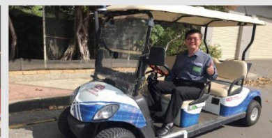
實驗自駕車 Experimental Self-Driving Car