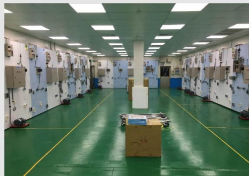
勞動部室配乙丙級認證考場 Qualified Site of The Machinery and Equipment of Skills Certification on skill category of Commercial wiring Class C & B