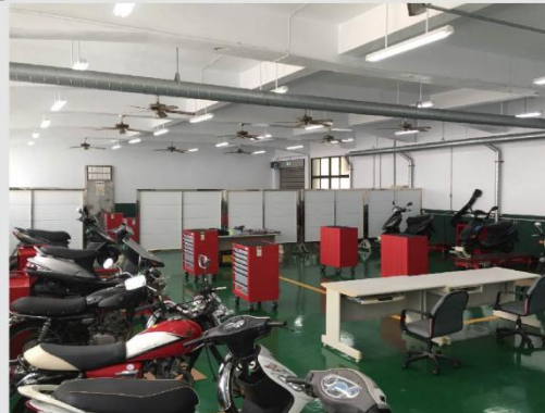
機器腳踏車乙級科檢定場地設備 Qualified Site of The Machinery and Equipment of Skills Certification on skill category of Motorcycle Service Repair Class B