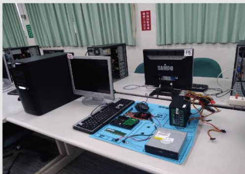
電腦硬體實驗室 Computer Hardware Laboratory