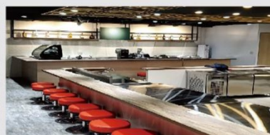
V-BAR Beverage Preparation Classroom