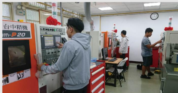
勞動部CNC車床乙級技術士考場 Qualified Site of The Machinery and Equipment of Skills Certification on skill category of Turning -CNC Turning Class B