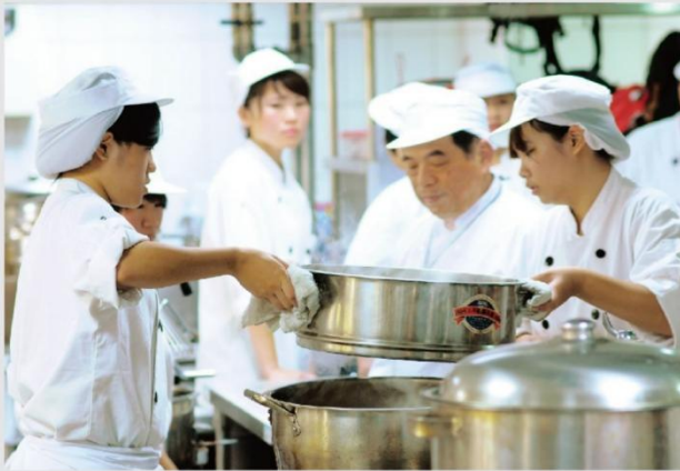
中式米食教室 Chinese Style Rice Food Classroom V105

⊕ 餐飲管理系 Department of Food and Beverage Management