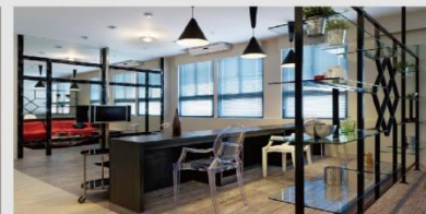
室內設計實習教室 Interior design practice classroom