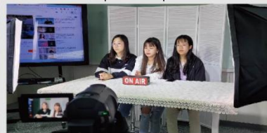
創意直播網紅體驗教室 Creative Live Stream Experience Classroom