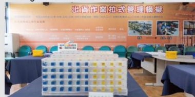
出貨作業拉式管理模擬教室 Shipping Operation Pull System Management Simulation Classroom