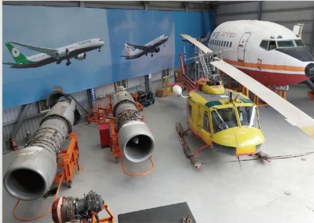
飛機與發動機維修實習區 Aircraft and Engine Maintenance Practice Area