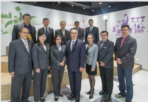
陣容堅強專任教師團隊 Strong Team of outstanding teachers