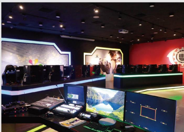
MB101電競館-比賽席及轉播台 E-sports hall