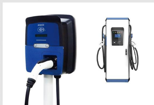
充電樁實習教室 Charging station practice classroom