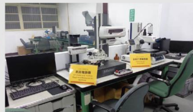
精密量測實驗室 Precision Metrology Laboratory