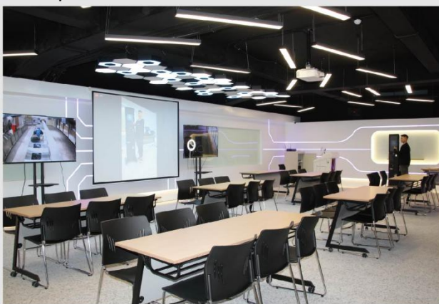
FB03-微型創業教室 FB03-Micro Entrepreneurship Classroom