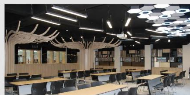
FB03-微型創業教室 FB03-Micro Entrepreneurship Classroom