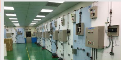
B103室內配線實驗室 Commercial Wiring Laboratory