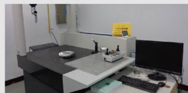
蔡司三次元量測機 ZEISS CMM