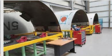
飛機結構維修實習區 Aircraft structure maintenance practice area