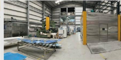
複材產品開發類工廠 Composite product development factory