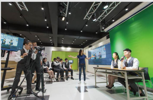
勞動部賈桃樂網紅直播專業教室 JobTaole Live Stream Classroom