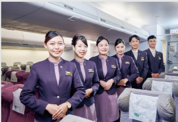
機艙實境教室 Aircraft Simulation Lab