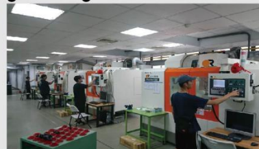
勞動部CNC銑床乙級技術士考場 Qualified Site of The Machinery and Equipment of Skills Certification on skill category of Milling CNC Milling Class B