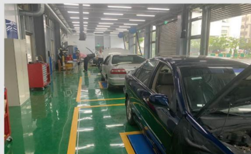
萬能車輛修護場 VNU Vehicle Maintenance Plant