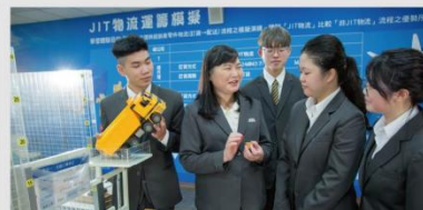
JIT物流運籌建置模擬教室 JIT Logistic Simulation Classroom