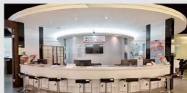
實習旅行社 Internship Travel Agency