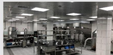
酒類釀造暨巧克力工藝實作教室 FB05 - Wine Brewing & Chocolate Art Practical Classroom