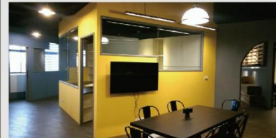
專題討論室 Seminar Discussion Room