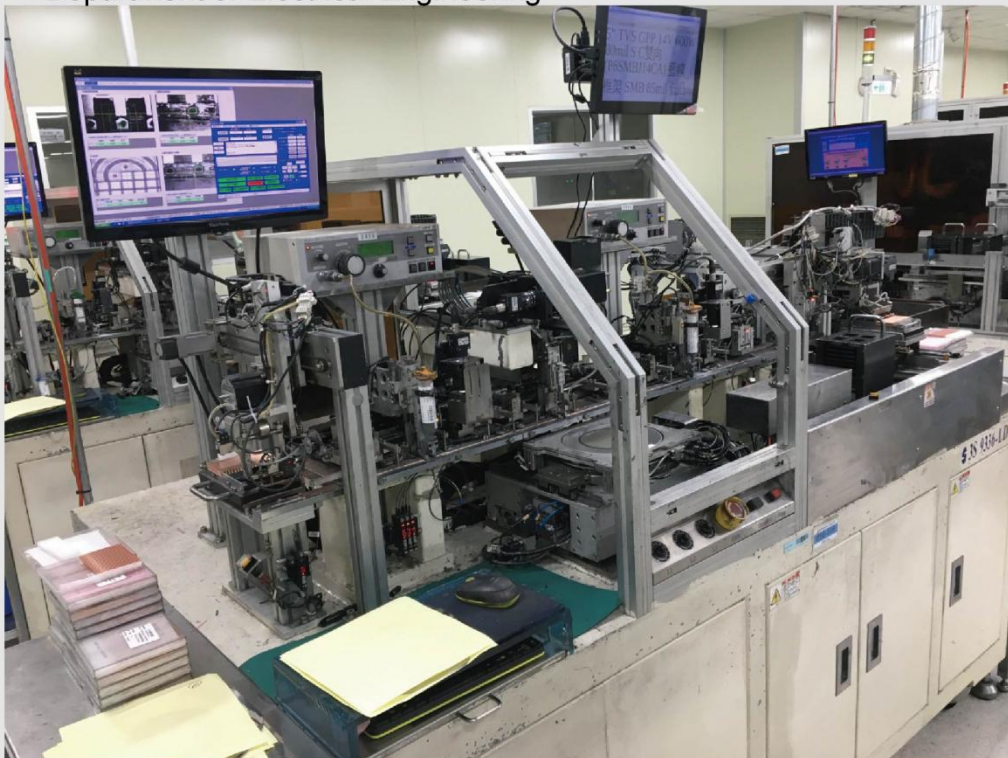
半導體封裝實驗室 Semi-Conductor Laboratory

⊕ 電機工程系 Department of Electrical Engineering