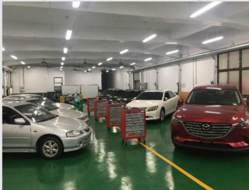
汽車實習工廠 Automotive Workshop