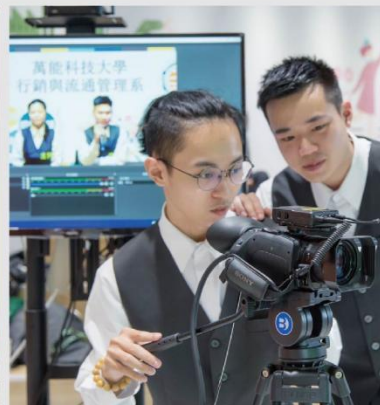
專業多媒體實作訓練 Professional Multimedia Practical Training