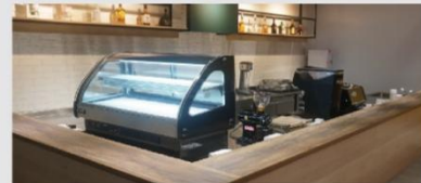
V吧-溫馨咖啡專業吧檯 FB01- Coffee Bar

College of Tourism, Hospitality and Management 觀光餐旅暨管理學院