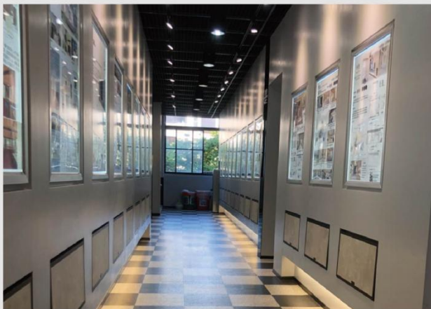
室設系廊道 Interior Design Hall