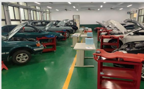
汽車乙級科檢定場地設備(第四五站) Qualified Site of The Machinery and Equipment of Skills Certification on skill category of Automotive Mechanic Class B