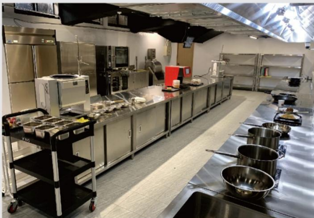
智慧餐旅創新中心 FB02 - Smart Hospitality Innovation Center