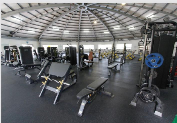
體適能中心 Fitness Center