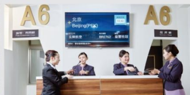
地勤實境教室 Ground Service Simulation Lab