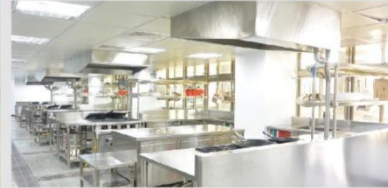
廚藝複合多功能教室 Culinary Multi-Functional Classroom V203