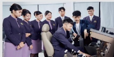
模擬飛行教室 Flight Simulation Lab